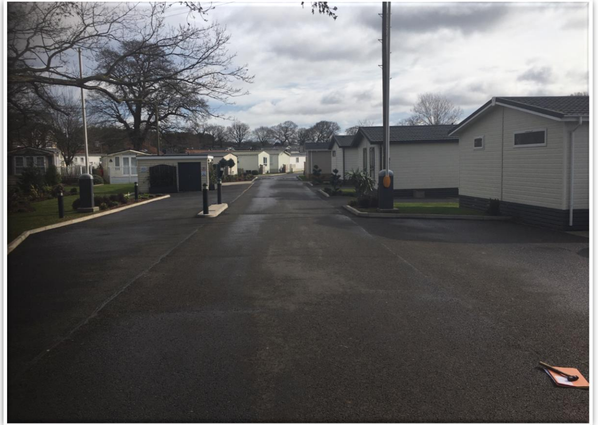
Security barrier within site